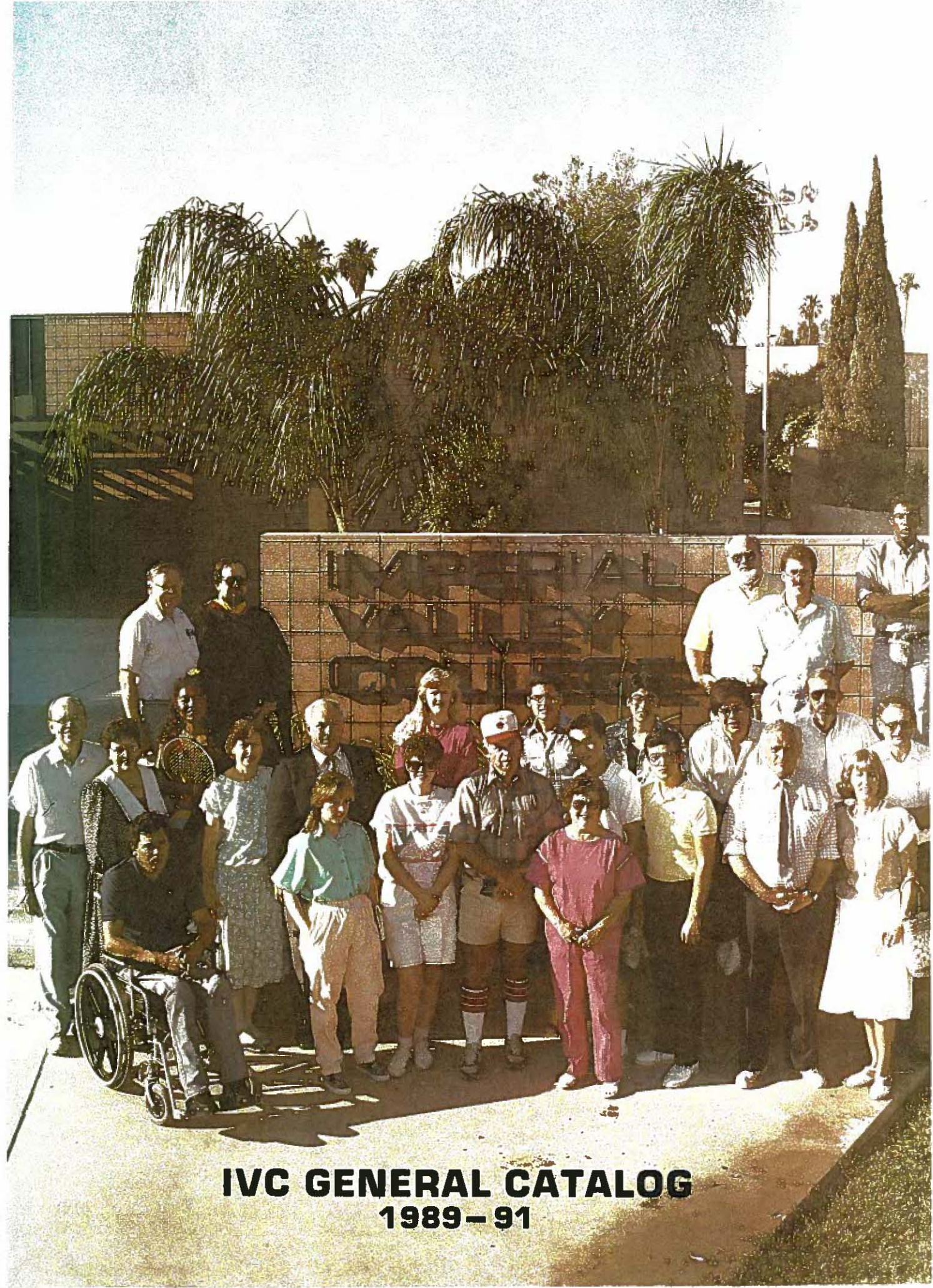
IVC GENERAL CATALOG 1989 - 91