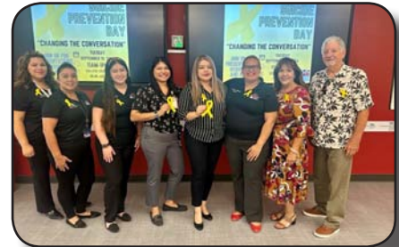
Fentanyl Awareness Summit 60 participants