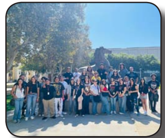
October 3rd, 2024 - Cal Poly Pomona, USC, & UCLA October 4th, 2024 - CSU Long Beach & UC Irvine