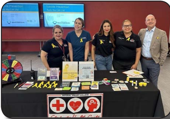
Workshops and Wellness Booths 210 students reached