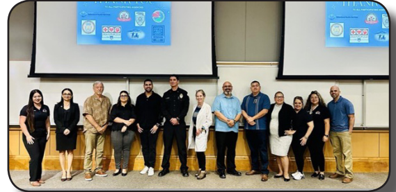
World Suicide Prevention Day 80 students